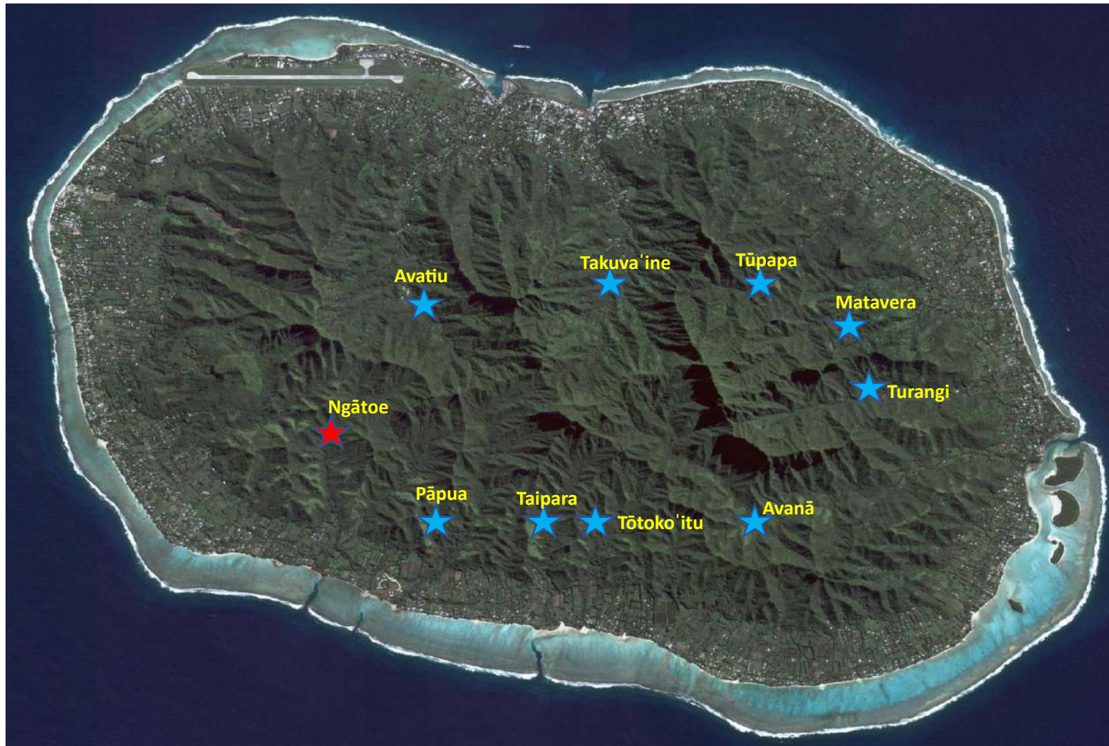
Figure 1 - Location of Rarotonga's Water Treatment Plants with Ngātoe in red

1. Where is the Ngātoe Water Treatment Plant?